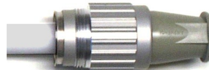
S 150, HVS 65, HVS 100, HVS 150 (Difference only in length)