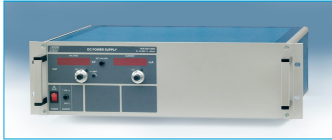
Rack adapter for a 19"- unit

For retrofitting of 19" rack adapters please state the height of the front panel!