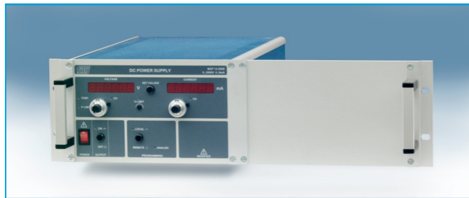
Rack adapter for a 1/2 19" unit with 1/2 19" blind panel