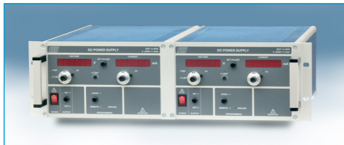
Rack adapter for two 1/2 19" units