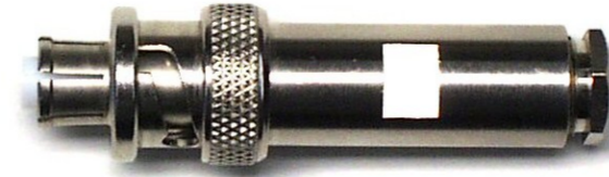
SHV- cable jack